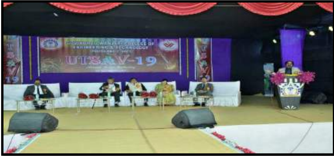
Open Air Stage for Cultural Programs