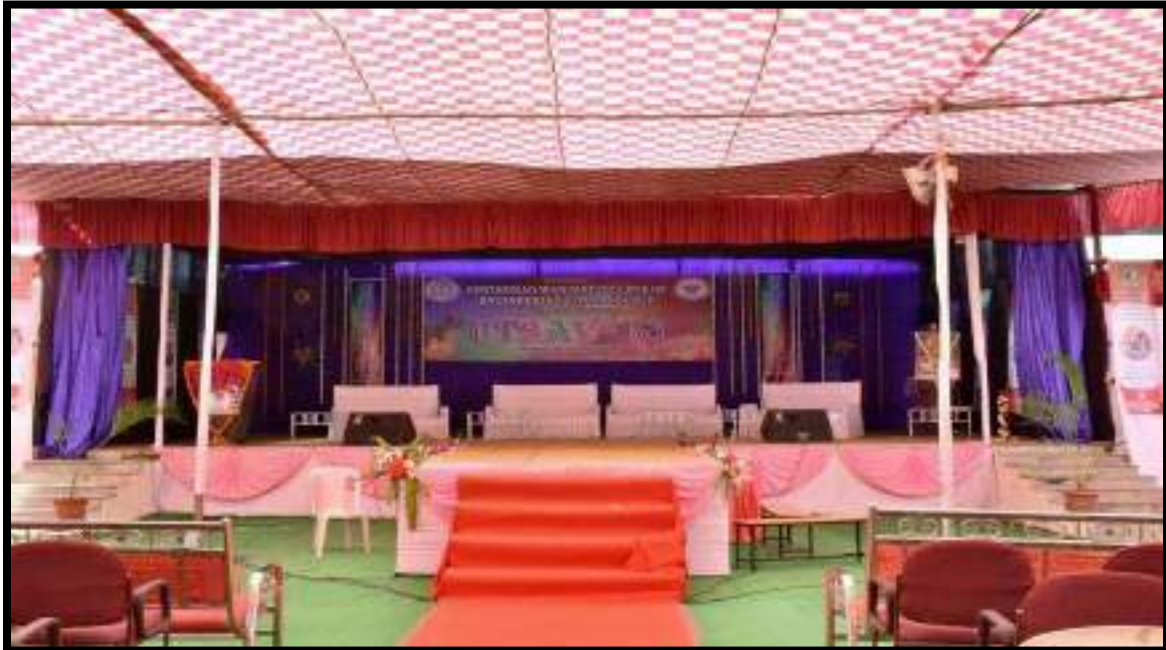
Open Air Stage for Cultural Programs