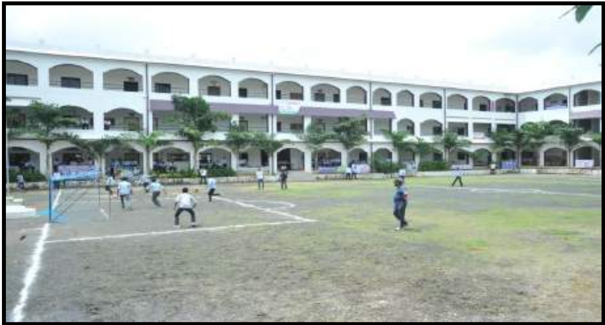
Inside the college Playground