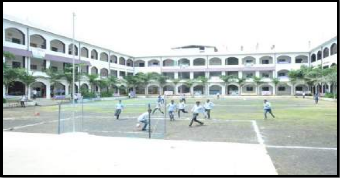
Inside the college Playground