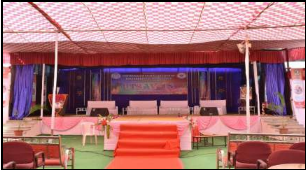
Open Air Stage for Cultural Programs