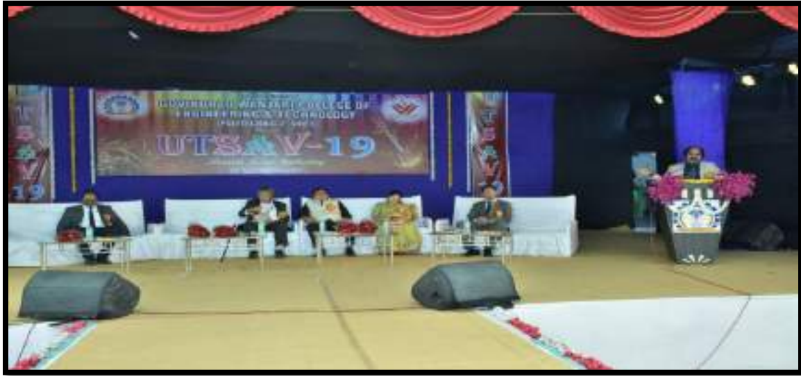
Open Air Stage for Cultural Programs