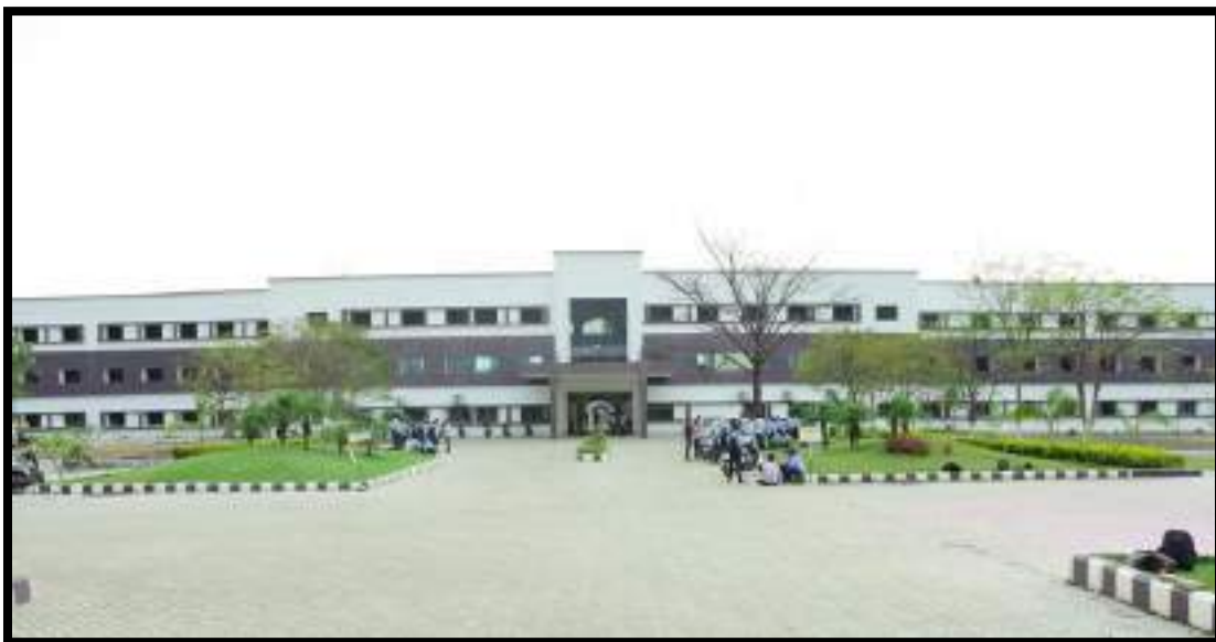
Inside the college