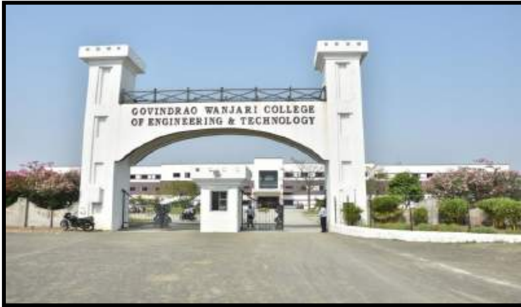
College Front View