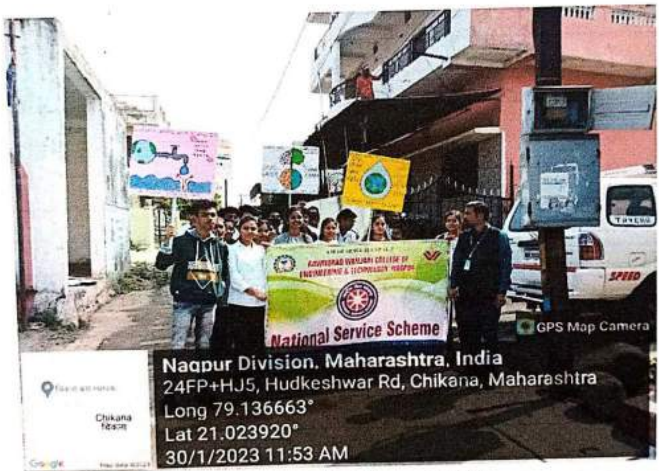
"Save Water , Save Earth Rally" at Chikna Village on 30/01/2023