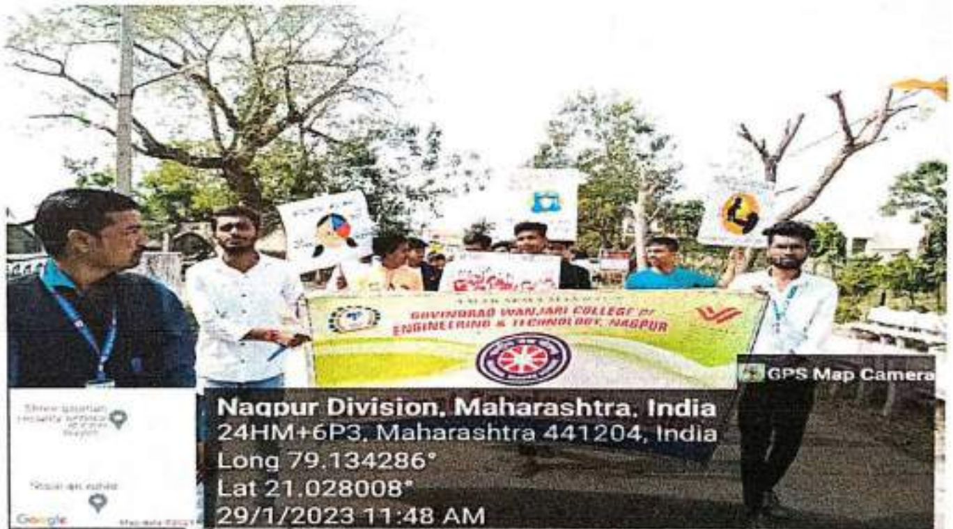
“Beti Padhao,Beti Bachao Abhiyaan rally“ at Chikna village on 29/01/2023