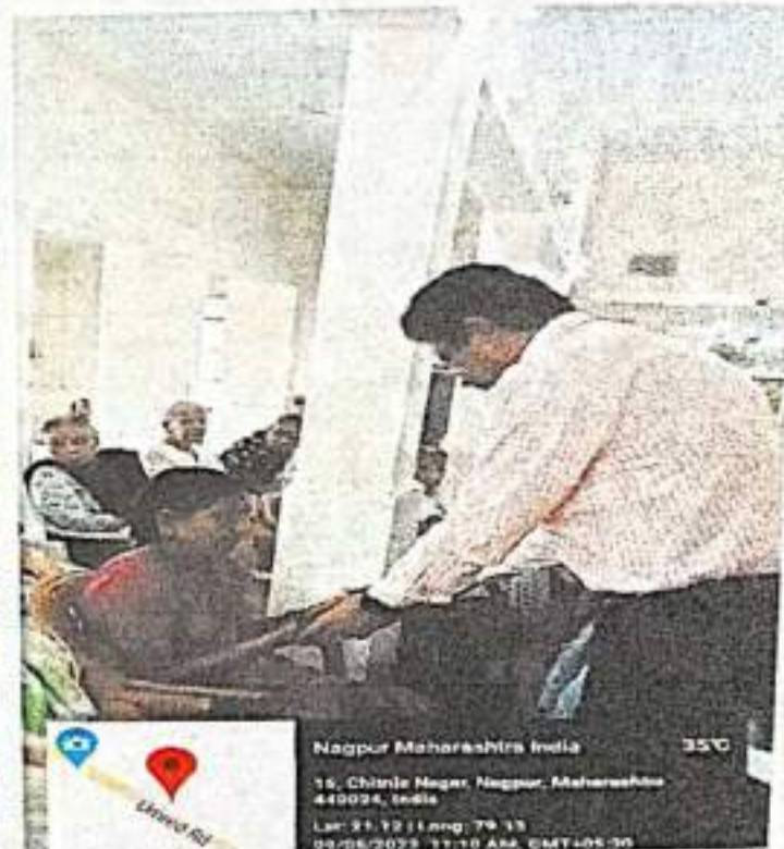
Cloths and Food Materials distribution at Panchvati old Age Home on 09/05/23