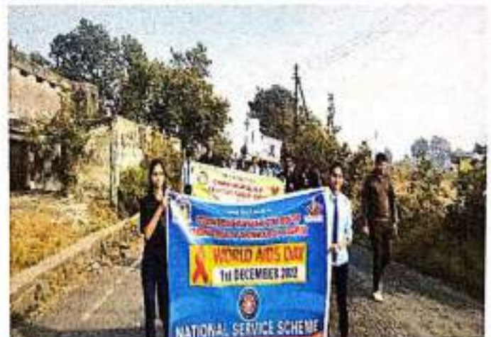
Aids awareness Rally at chikna village on 02/12/22