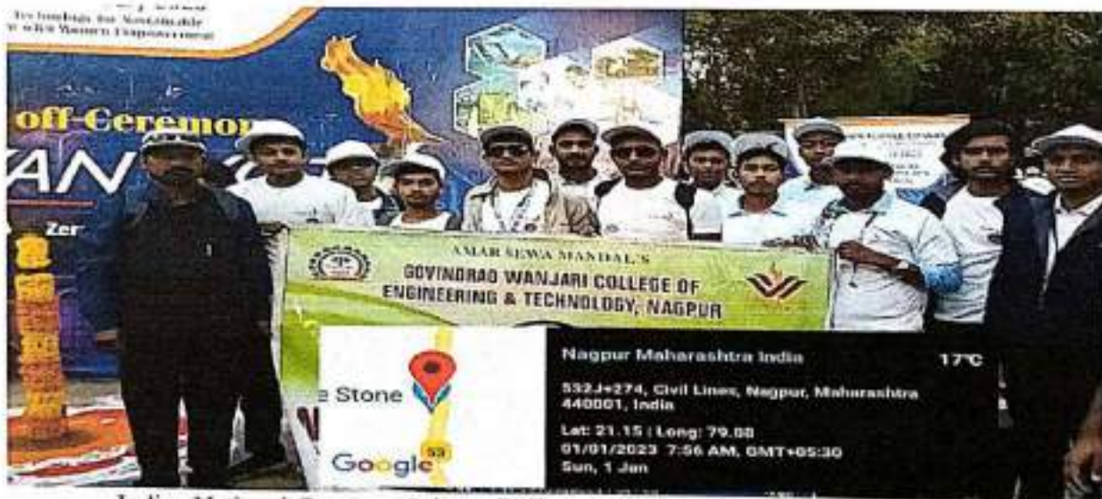
Indian National Congress Science Rally at RBI Square on 01 st Jan 2023