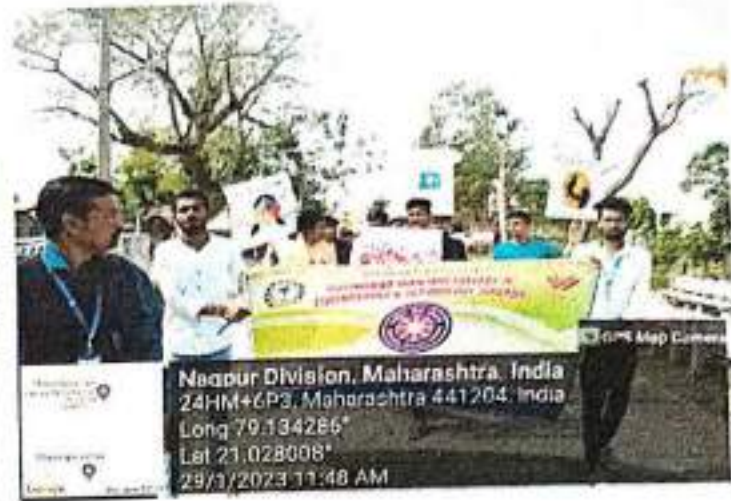
Various Social activities in NSS Annual Special Camp-23 at Chikna Gram-Panchayat