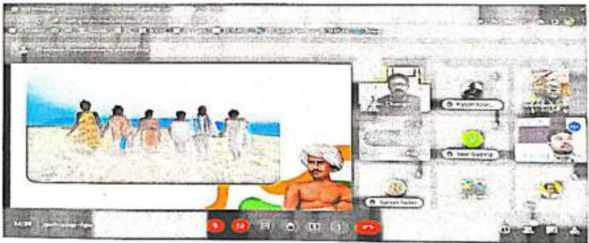
Webinar Series on Tribal Heroes of Independence from 22/11/2022 to 24/11/2022.