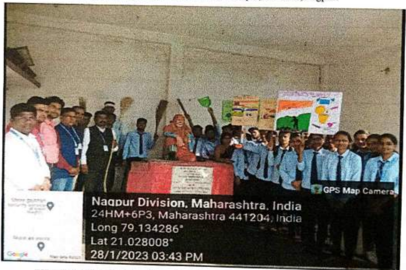
"Cleanliness drive of Chikna village : Swachata Abhiyaan Rally " on 28/01/2023