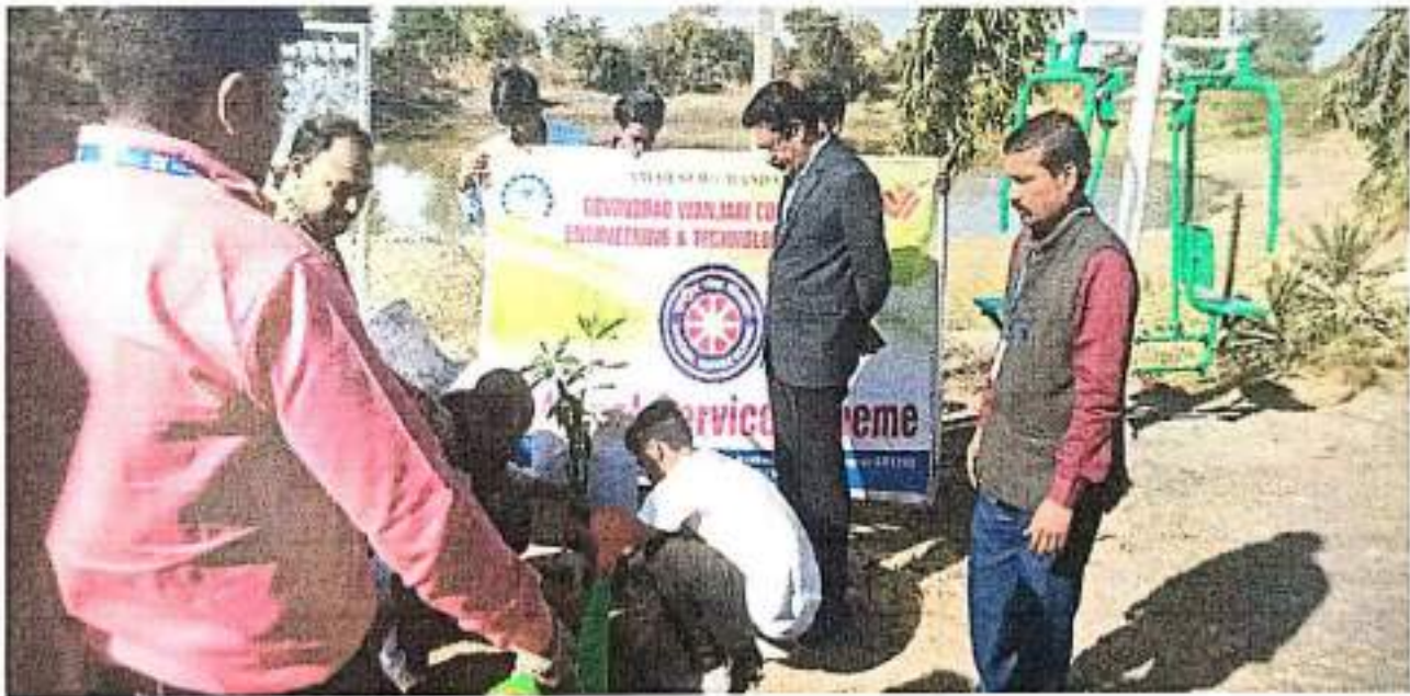
Tree plantation at Chikna village on 31/01/2023