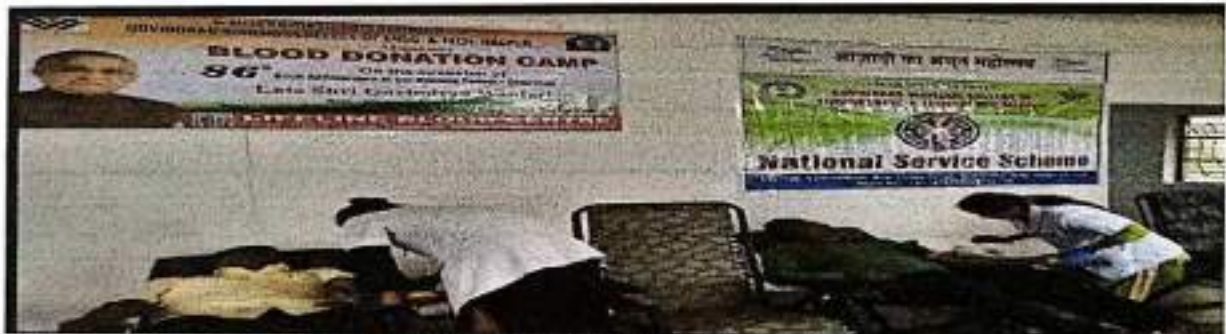
Blood Donation Camp at GW CET on 10/08/2022